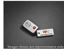
Remote Start $ 499