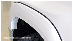
Fender Flares $ 625