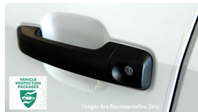
Vehicle Protection Plus Package $ 399