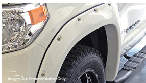
Pocketed Fender Flares $ 675