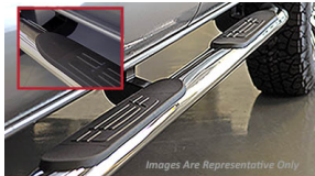
5 Inch Oval Chrome Step Tube $ 679