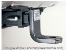
Ball Mount $ 79