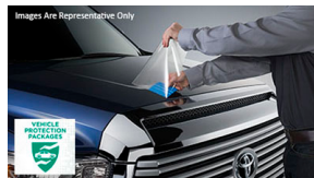
Vehicle Protection Premium Package $ 499