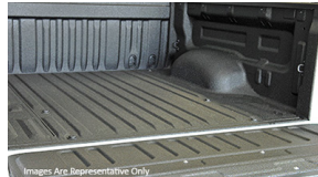
Spray-On Bedliner $ 529