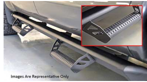
Predator Step Tube $ 689