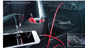
Connectivity Kit $ 59