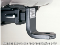
Ball Mount $ 79