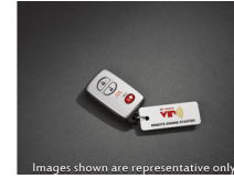
Remote Engine Start $ 499