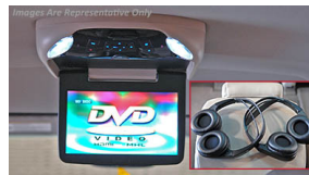
Rear Seat Entertainment Package $ 1829