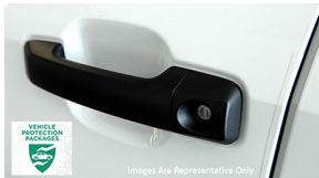
Vehicle Protection Plus Package $ 399