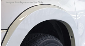
Fender Flares $ 625