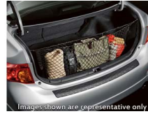
Cargo Net $ 49