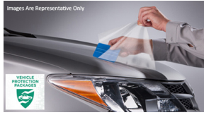
Vehicle Protection Premium Package $ 499