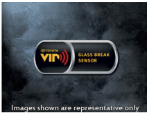
Glass Break Sensor $ 299