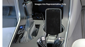
Connectivity Kit $ 59